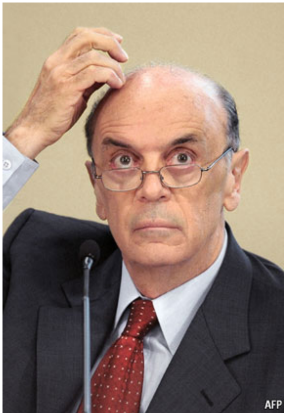
Serra ponders how he fell behind

The government also hopes to create a national oil-supply industry. It is drawing up requirements that equipment, from tankers to service platforms and drilling rigs, should be mainly locally produced. Already Petrobras is doing much of its procurement locally, and officials point to a revival in Brazil's shipbuilding industry as an early success. Provided such restrictions are temporary, they may pay off for the oil industry. But there are risks. One is a repeat of the mistakes of the 1970s, when a government attempt to develop a computer industry by banning imports cut Brazil off from new technology. Another is placing too much strain on Petrobras, which has also been required by the government to build four new refineries.