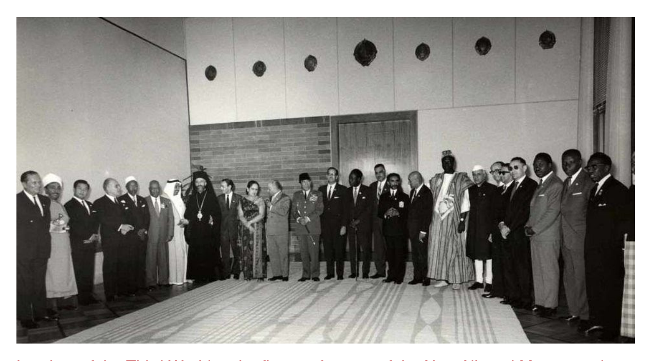
Leaders of the Third World at the first conference of the Non-Aligned Movement in Belgrade, 1961.

Interestingly, this revival of sovereign politics is not being driven by inward-looking nationalism, but by a non-aligned internationalism. The BRICS ministers' statement focuses on 'strengthening multilateralism and upholding international law, including the purposes and principles enshrined in the Charter of the United Nations as its indispensable cornerstone' (incidentally, both China and Russia are part of the twenty-member <u>Group of Friends in Defence of the UN Charter</u>). The implicit argument being made here is that the US-led Triad states have unilaterally imposed their narrow worldview, based on the interests of their elites, on the countries of the South under the guise of the 'rules-based international order'. Now, the states of the Global South argue, it is time to return to the source – the UN Charter – and build a genuinely democratic international order.