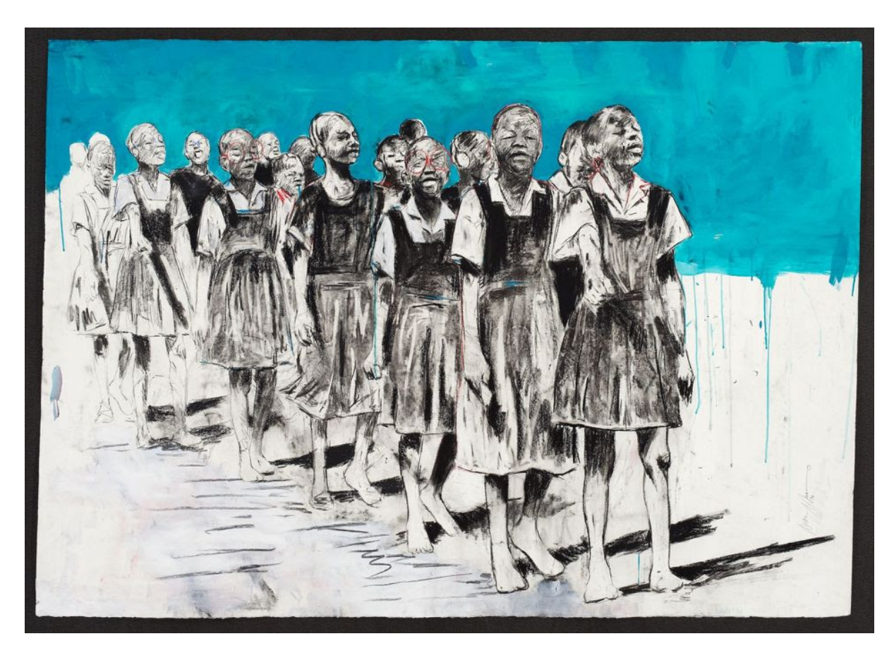
Nelson Makamo (South Africa), The Announcement, 2016.

It is this re-assertion of national and regional interests within the Global South that has revived a set of regional processes, including the Community of Latin American and Caribbean States (CELAC) and the BRICS (Brazil-Russia-India-China-South Africa) process. On 1 June, the BRICS foreign ministers met in Cape Town (South Africa) ahead of the summit between their heads of states that is set to take place this August in Johannesburg. The joint statement they issued is instructive: twice, they warned about the negative impact of 'unilateral economic coercive measures, such as sanctions, boycotts, embargoes, and blockades' which have 'produced negative effects, notably in the developing world'. The language in this statement represents a feeling that is shared across the entirety of the Global South. From Bolivia to Sri Lanka, these countries, which make up the majority of the world, are fed up with the IMF-driven debt-austerity cycle and the Triad's bullying. They are beginning to assert their own sovereign agendas.